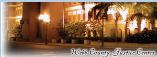
Webb County Justice Center

The 406th District Court can provide facilities on-location in other cities via Remote Broadcasting. Magistrations, arraignments and child victims' testimony can take place before the Court through video conferencing, without having to be physically present in the courtroom itself, saving the taxpayers on transportation costs from the various state jail facilities while benefiting the child victims who can also testify before the Court in a remote location, in a familiar setting, and from different locations elsewhere in the city.